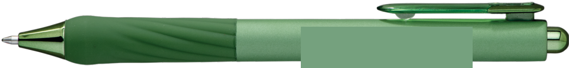
Green w/ Black Ink