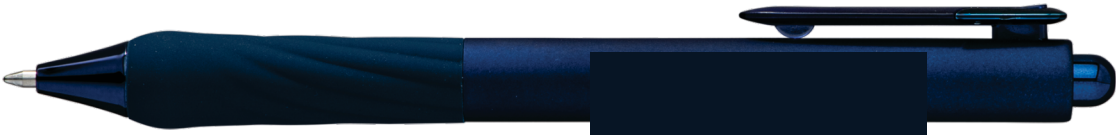
Bluew/ Black Ink