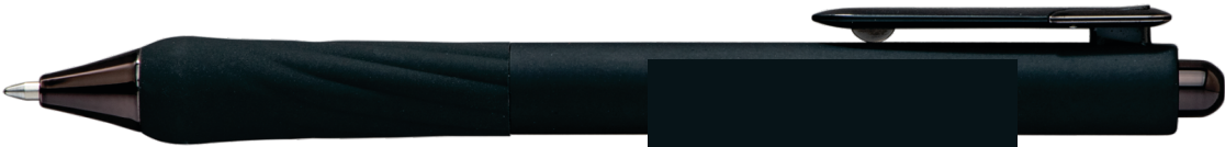
Black w/ Black Ink