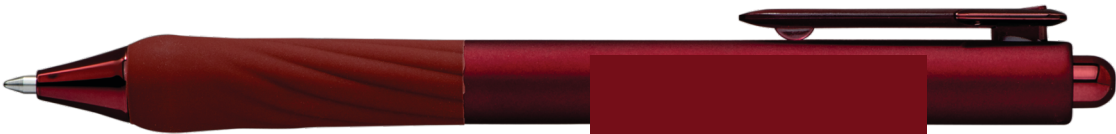
Red w/ Black Ink